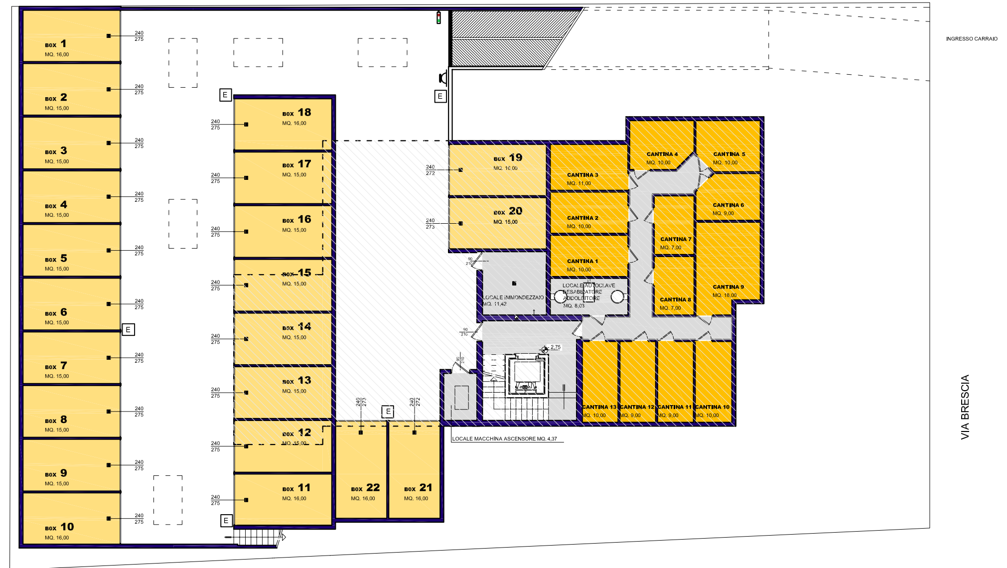
PIANTA PIANO INTERRATO rapp. 1 : 200